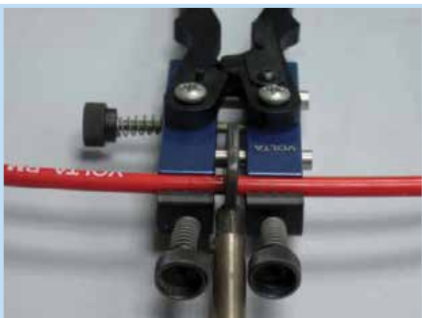
R8 Mini Pliers for smaller profiles