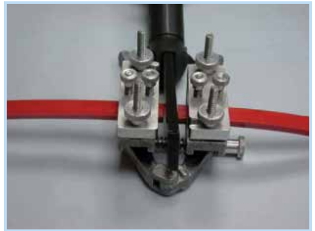
F51 Pliers for larger profiles