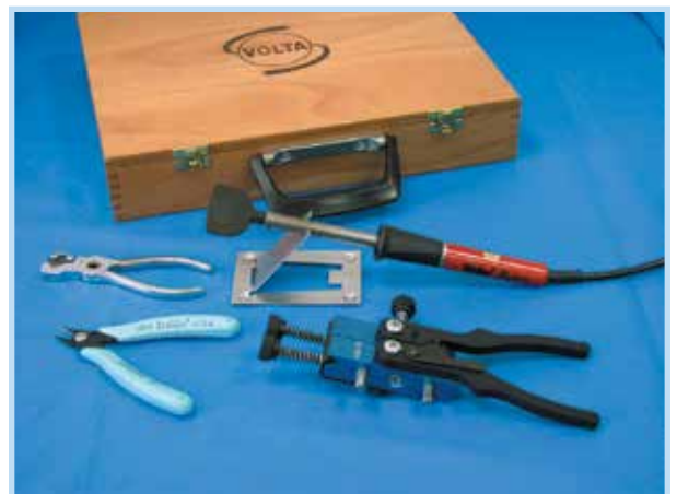
Kit for small profile welding